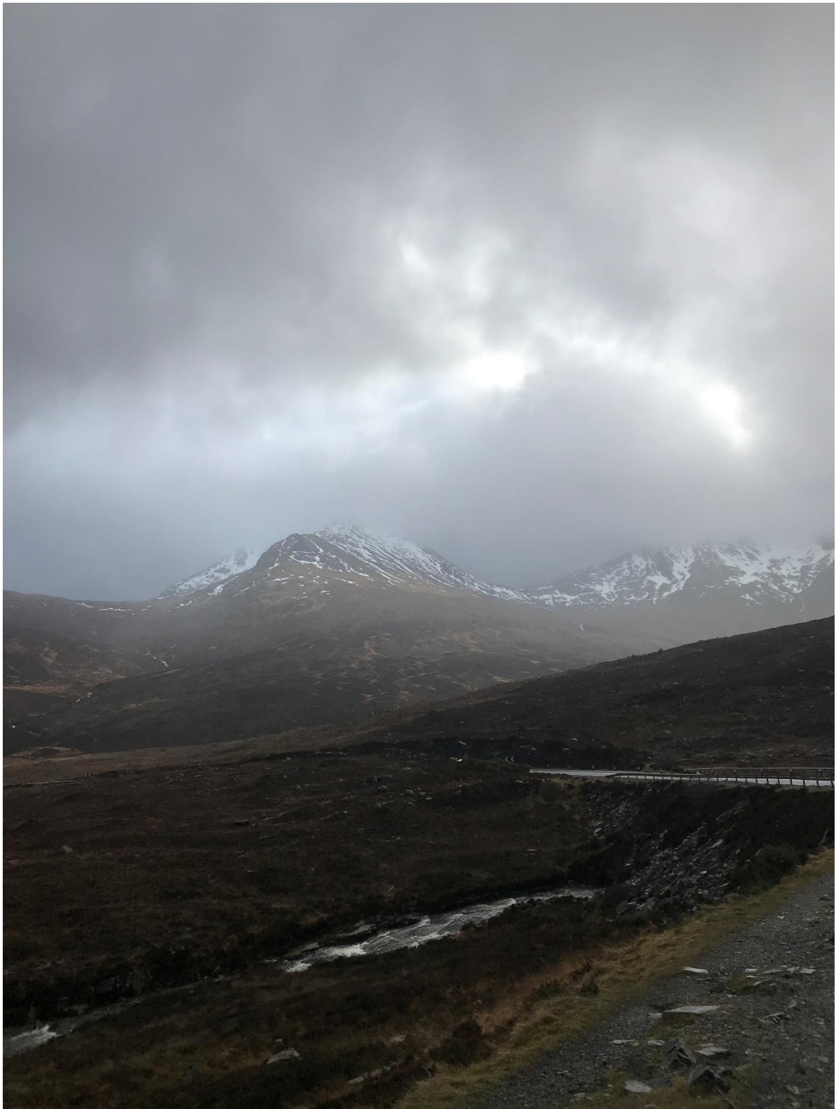
A view from the A87 between Broadford and Portree, near Sligachan