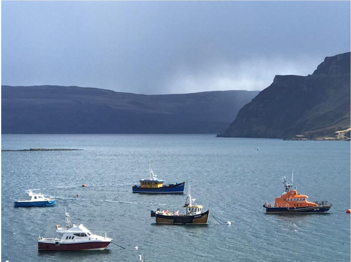
A view of Portree Bay, including RNLB Stanley Watson Barker , taken from Portree Hospital